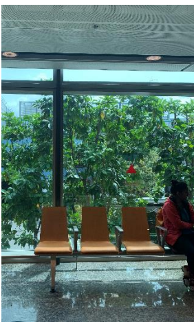
Pic. 1 – Obstructed Fireman Access Panel