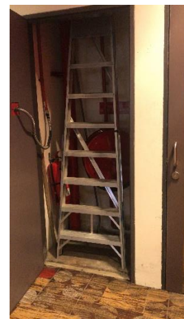
Pic. 3 – Obstructed Firefighting Provisions