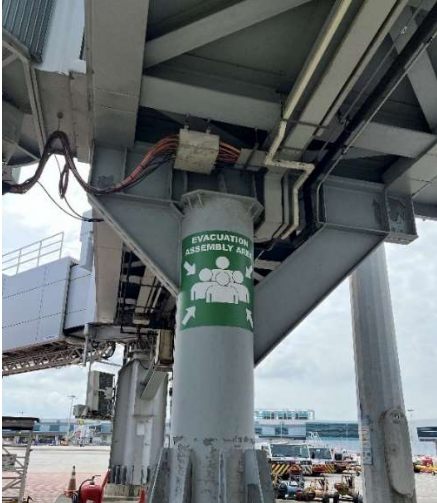
Assembly Area Signage