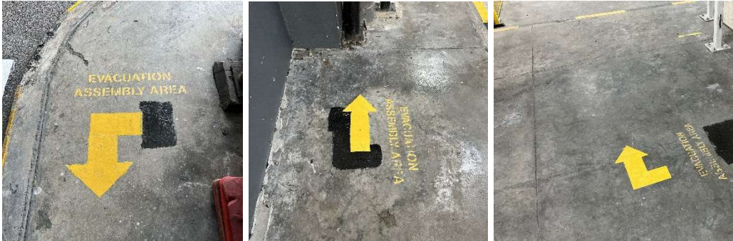
Wayfinding arrows to EAA